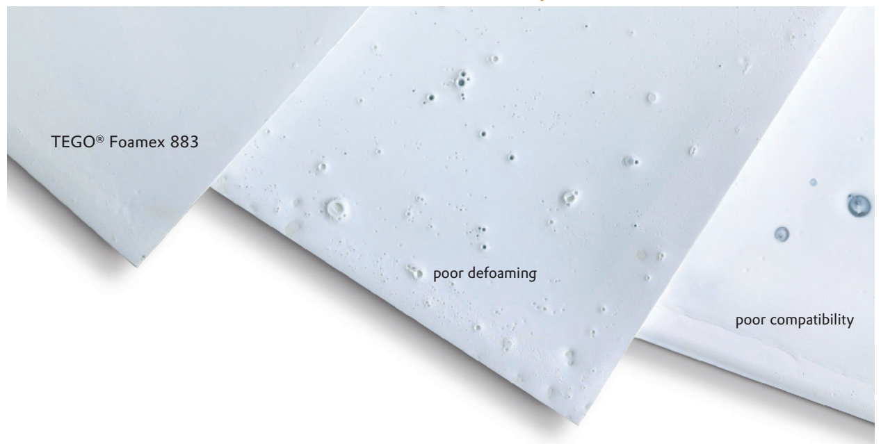
Good performance of TEGO® Foamex 883 vs. poor defoaming/compatibility

VOC regulations and end user awareness nourish the trend towards environmentally friendly waterborne paints. New polymer emulsions, which do not require solvents as coalescing agents, play an important role in the development of low VOC paints. These polymer emulsions are different with regard to the polymer and their emulsifier. This new polymer technology can be a very demanding task for the defoamer. Many defoamers are not capable of defoaming these low VOC systems while maintaining performance properties.